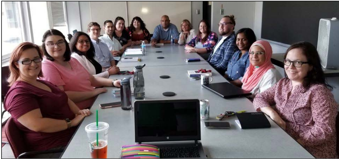
Sociology graduate students, Spring 2019.